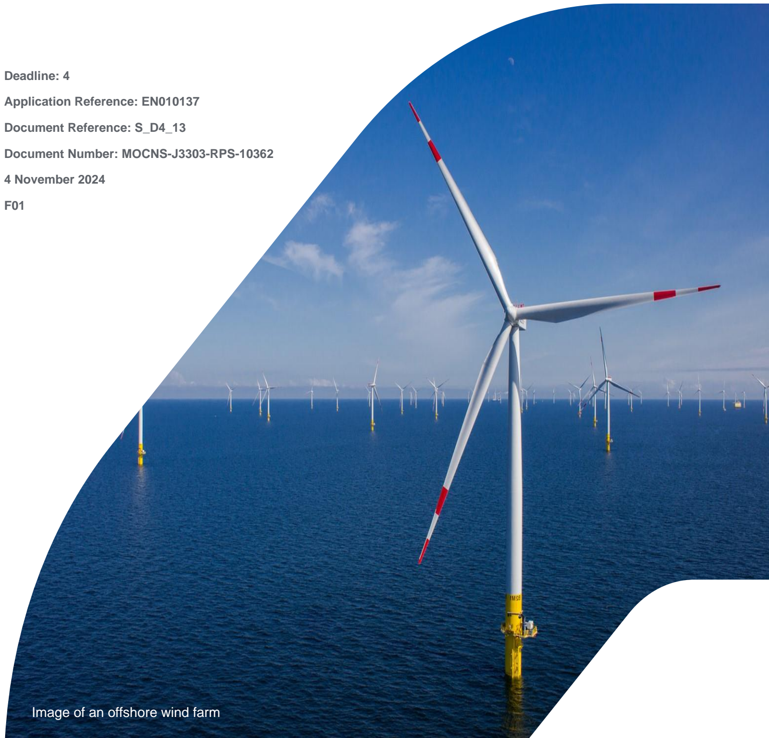
Image of an offshore wind farm